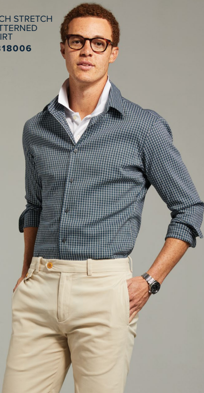
TECH STRETCH PATTERNED SHIRT BB18006