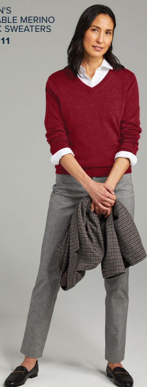
WOMEN'S WASHABLE MERINO V-NECK SWEATERS BB18411