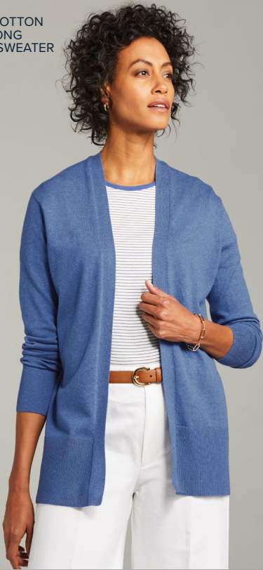
WOMEN'S COTTON STRETCH LONG CARDIGAN SWEATER BB18403