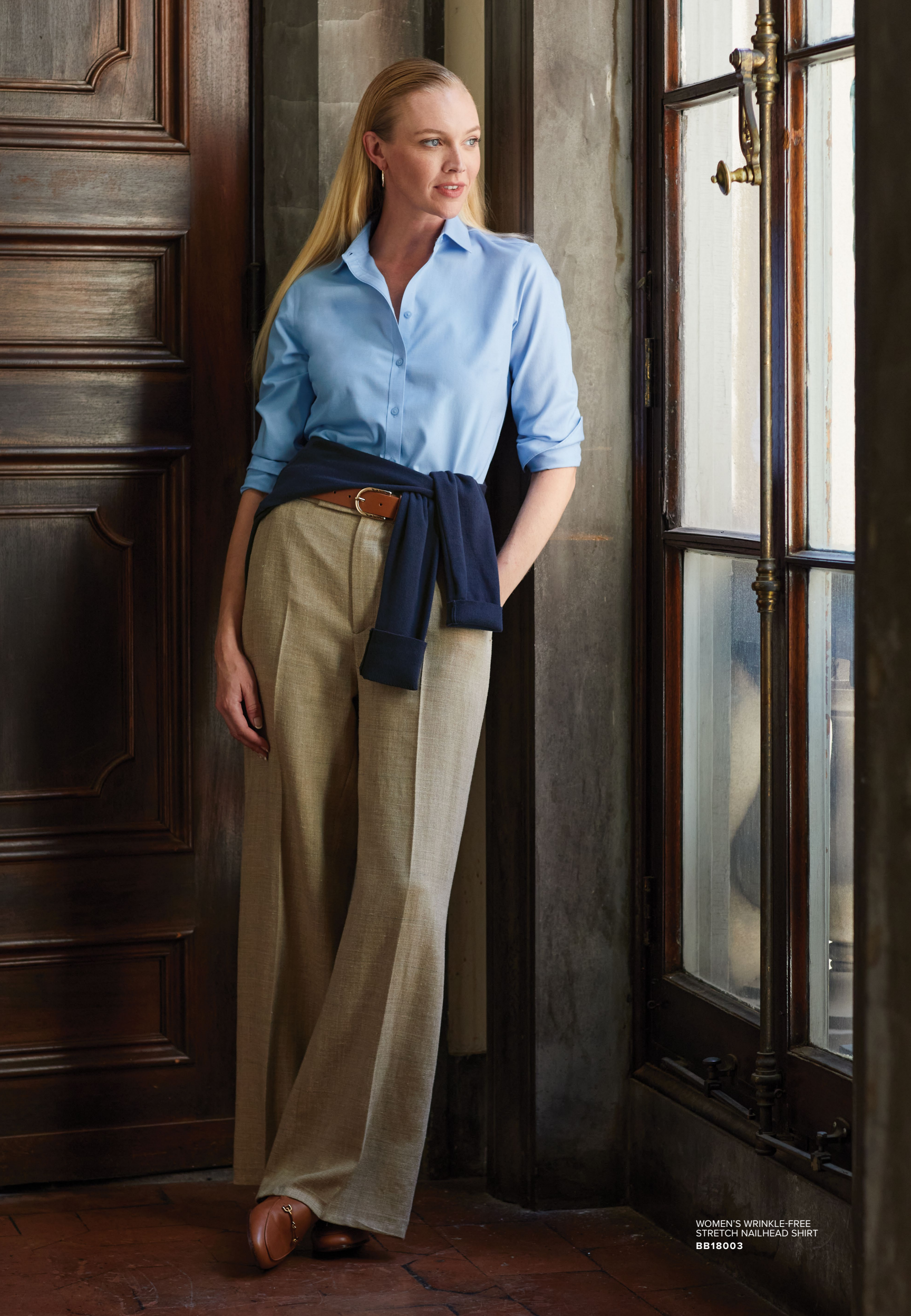
WOMEN'S WRINKLE-FREE STRETCH NAILHEAD SHIRT BB18003