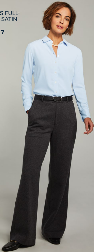
WOMEN'S FULL-BUTTON SATIN BLOUSE BB18007