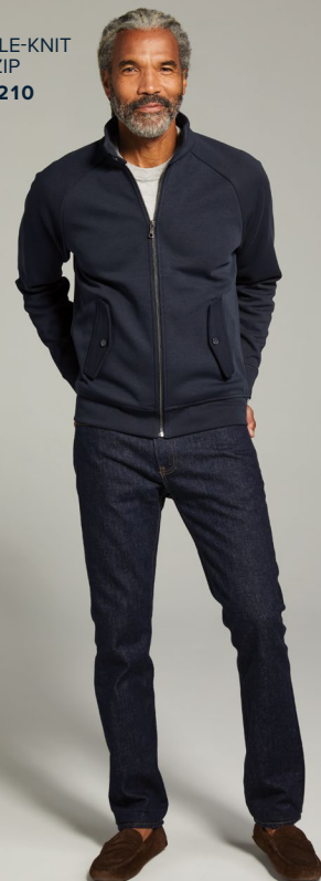
DOUBLE-KNIT FULL-ZIP BB18210