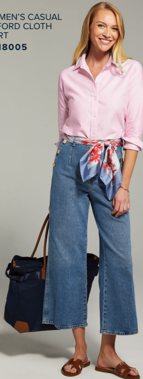
WOMEN'S CASUAL OXFORD CLOTH SHIRT BB18005