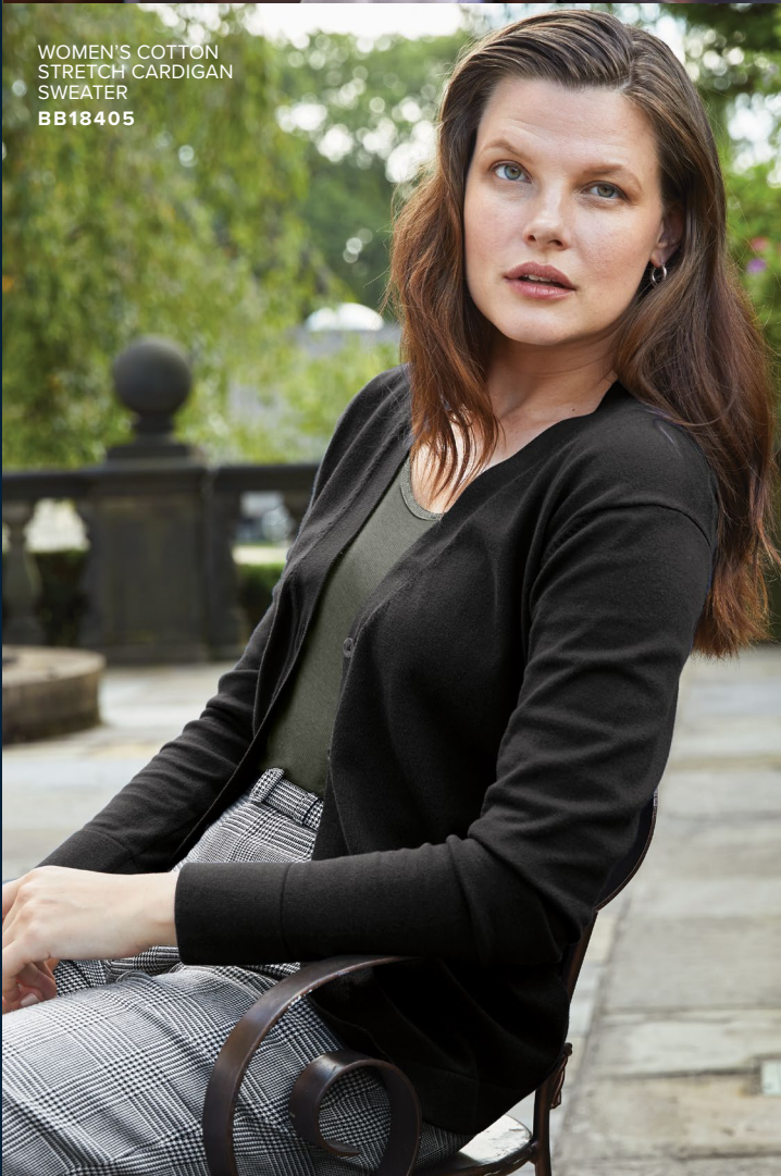
WOMEN'S COTTON STRETCH CARDIGAN SWEATER BB18405