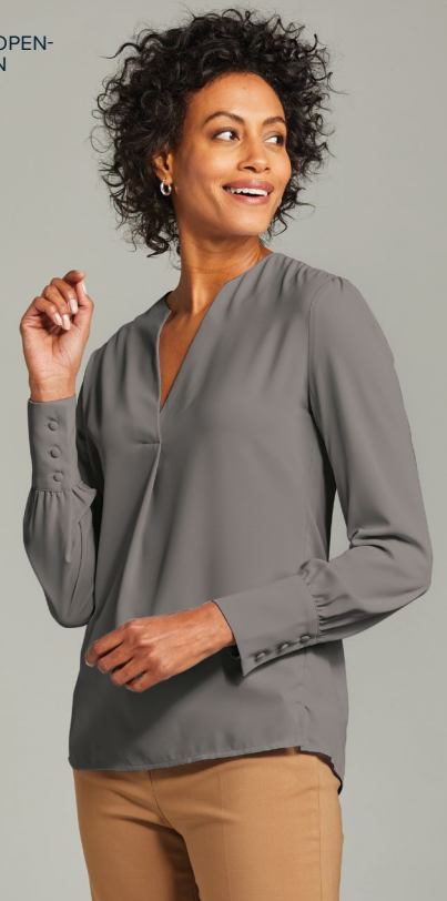
WOMEN'S OPEN- NECK SATIN BLOUSE BB18009