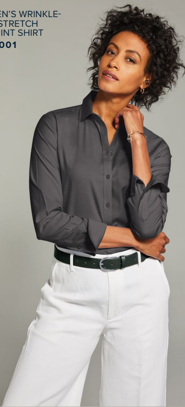
WOMEN'S WRINKLE-FREE STRETCH PINPOINT SHIRT BB18001