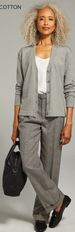
WOMEN'S COTTON STRETCH CARDIGAN SWEATER BB18405