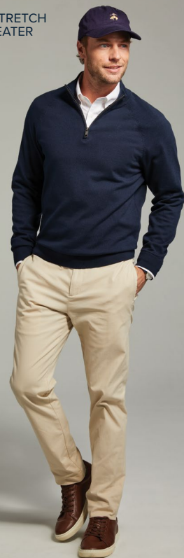
COTTON STRETCH 1/4-ZIP SWEATER BB18402