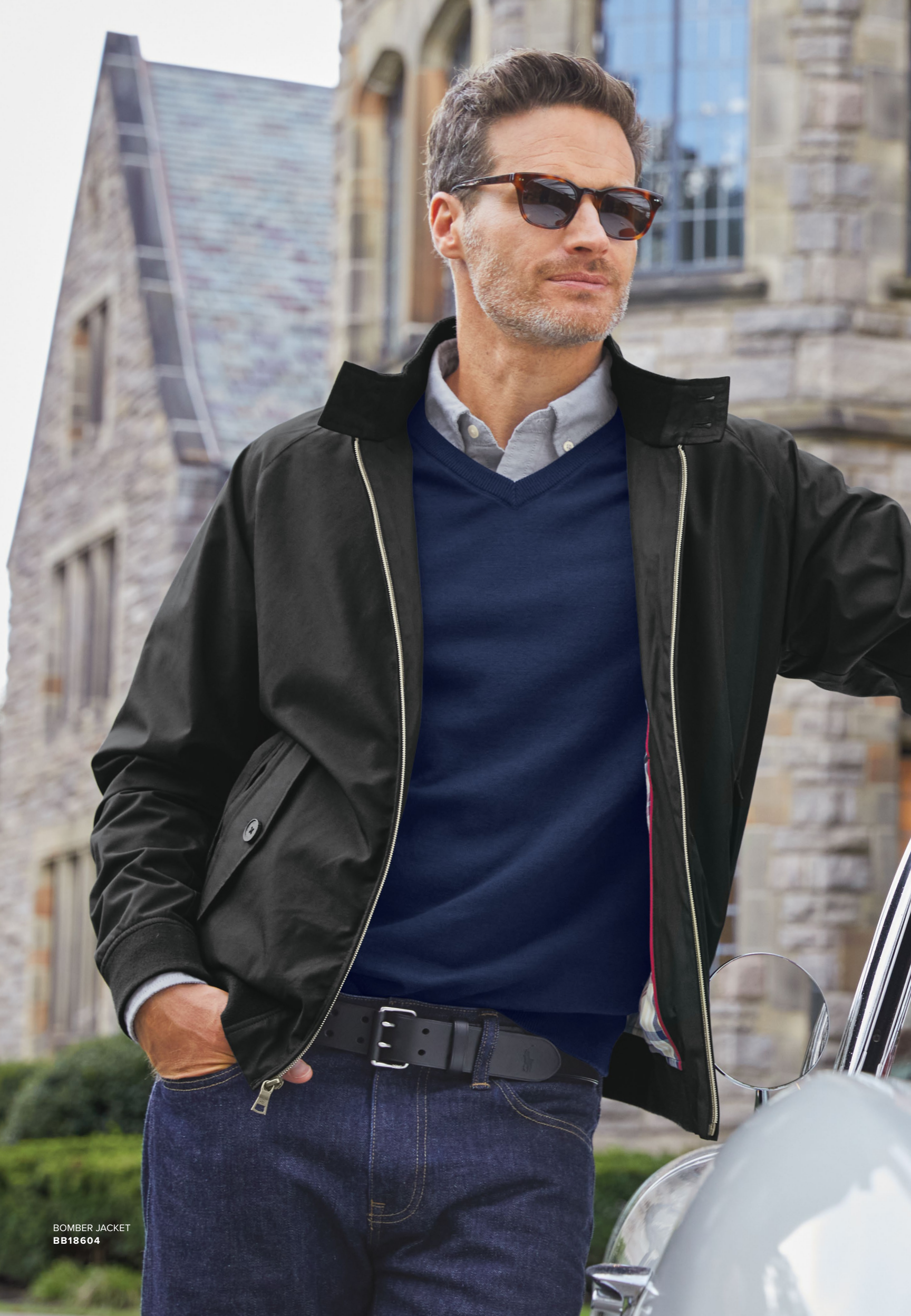
BOMBER JACKET BB18604