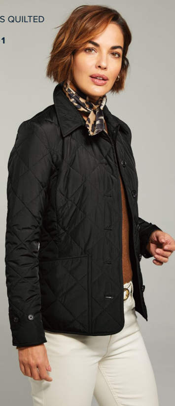
WOMEN'S QUILTED JACKET BB18601