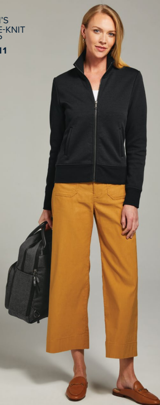
WOMEN'S DOUBLE-KNIT FULL-ZIP BB18211