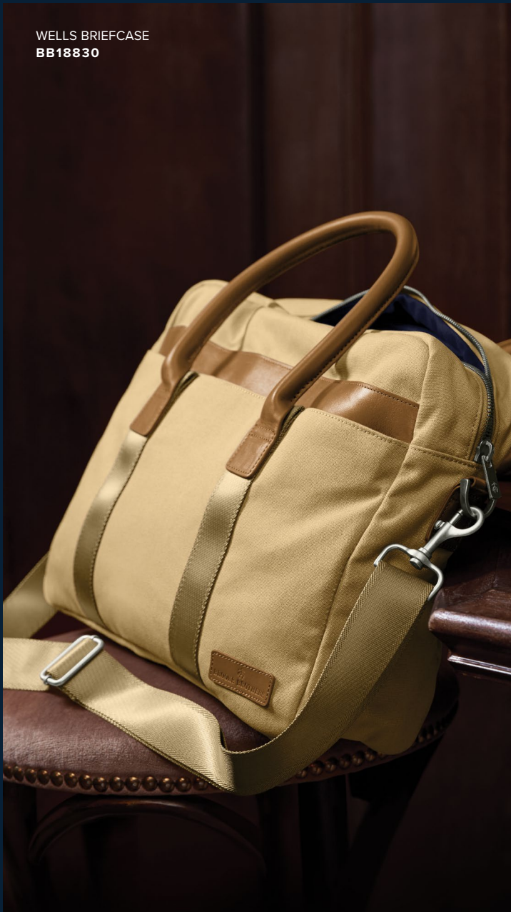
WELLS BRIEFCASE BB18830