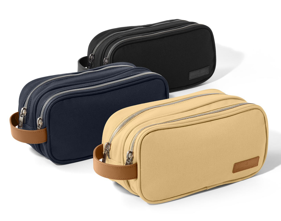
BB18870 Brooks Brothers® Wells Dopp Kit