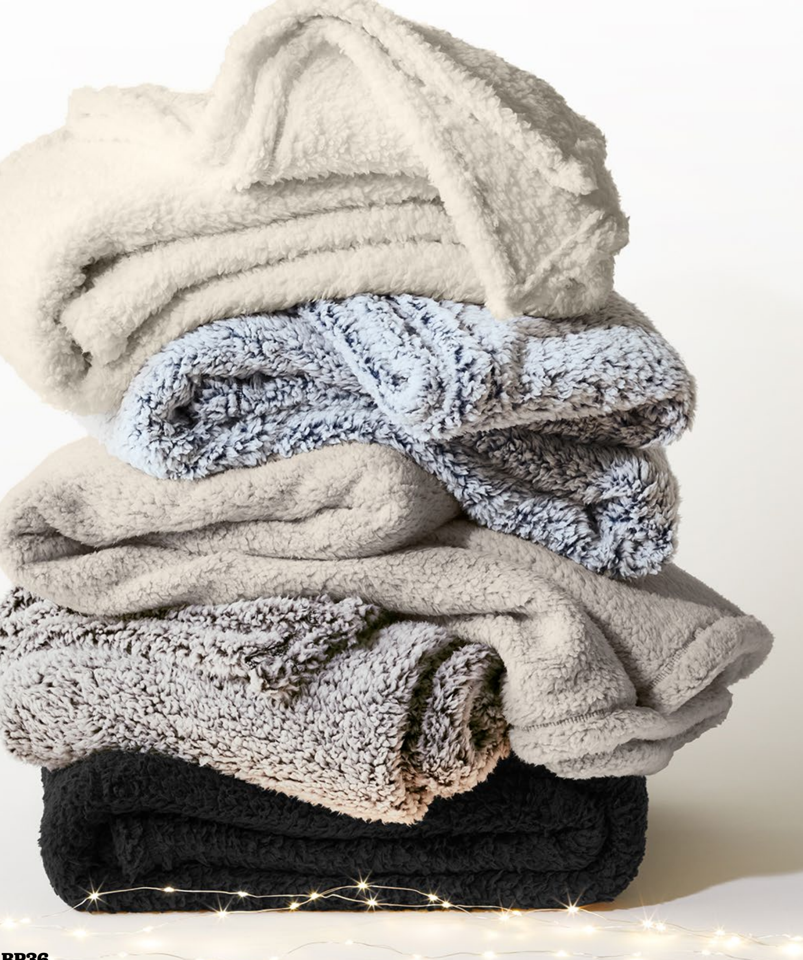
BP36 Port Authority® Cozy Blanket

Comfort and well-being are gifts that last all year round. Apparel and accessories that encourage physical fitness, mental health and well-being can feel like a thoughtful holiday hug when it's needed most.