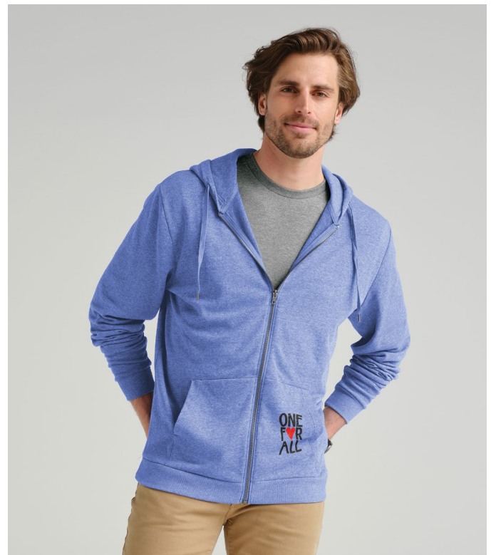
DISTRICT Perfect Tri Fleece Full-Zip Hoodie DT1302 Adult Sizes: XS-4XL | 6 colors Worn with DM130