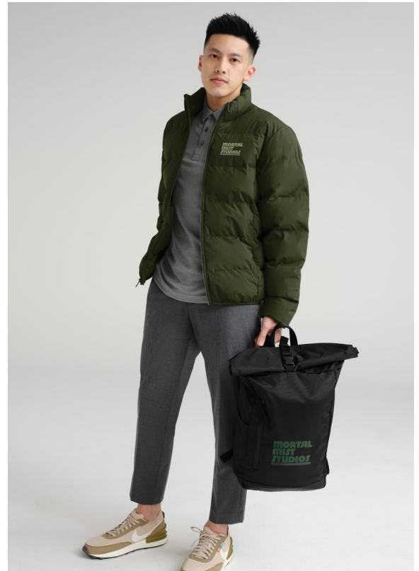
MERCER + METTLE Rucksack MMB201 One Size Fits All | 1 color Worn with TM1MU412, MM7210