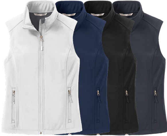
PORT AUTHORITY Ladies Core Soft Shell Vest L325 Women's Sizes: XS-4XL | 5 colors