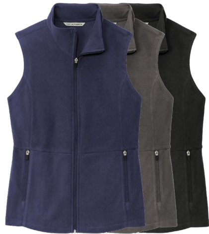
PORT AUTHORITY Ladies Accord Microfleece Vest L152 Women's Sizes: XS-4XL | 3 colors