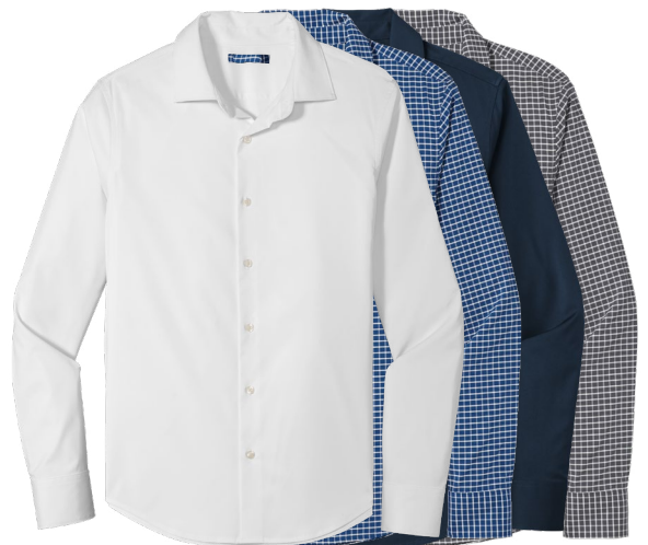
PORT AUTHORITY City Stretch Shirt W680 Adult Sizes: XS-4XL | 5 colors