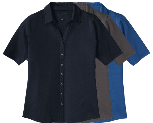
PORT AUTHORITY Ladies City Stretch Top LK682 Women's Sizes: XS-4XL | 5 colors