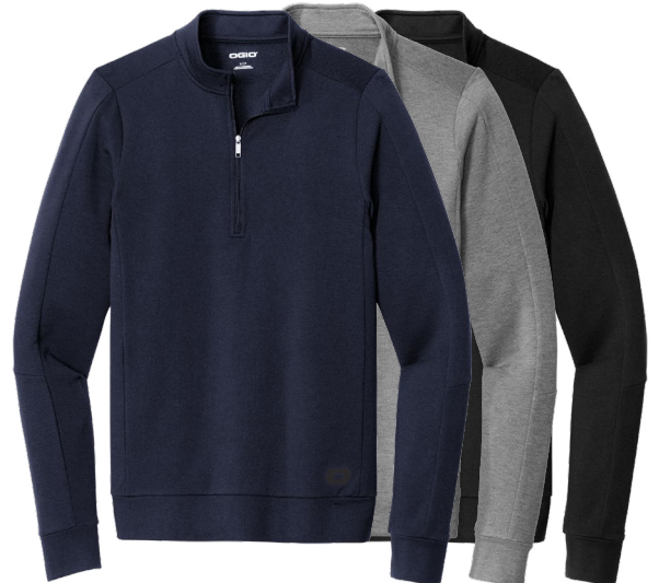
OGIO Luuma 1/2-Zip Fleece OG813 Adult Sizes: XS-4XL | 3 colors