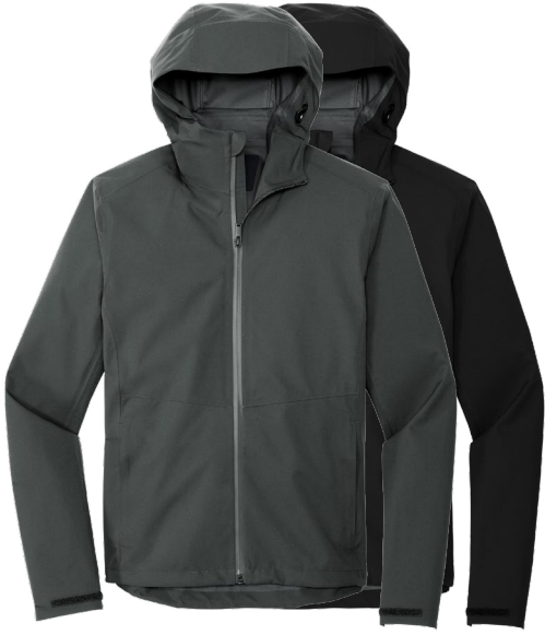
MERCER + METTLE Waterproof Rain Shell MM7000 Adult Sizes: XS-4XL | 2 colors