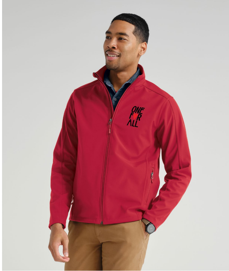
PORT AUTHORITY Core Soft Shell Jacket J317 Adult Sizes: XS-6XL | 11 colors Worn with W676