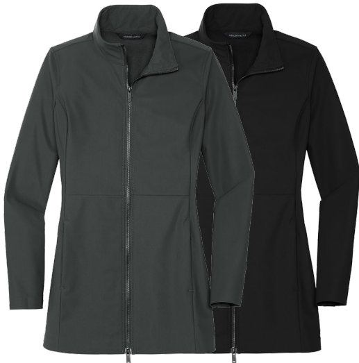
MERCER + METTLE Women's Faillie Soft Shell MM7101 Women's Sizes: XS-4XL | 2 colors