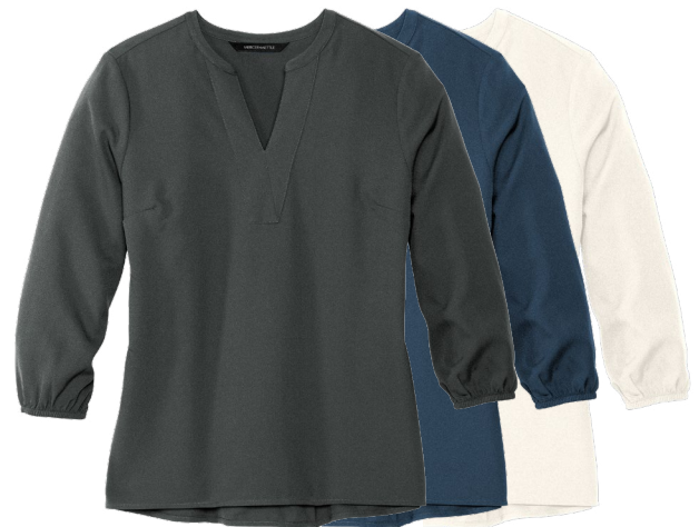
MERCER + METTLE Women's Stretch Crepe 3/4-Sleeve Blouse MM2011 Women's Sizes: XS-4XL | 5 colors