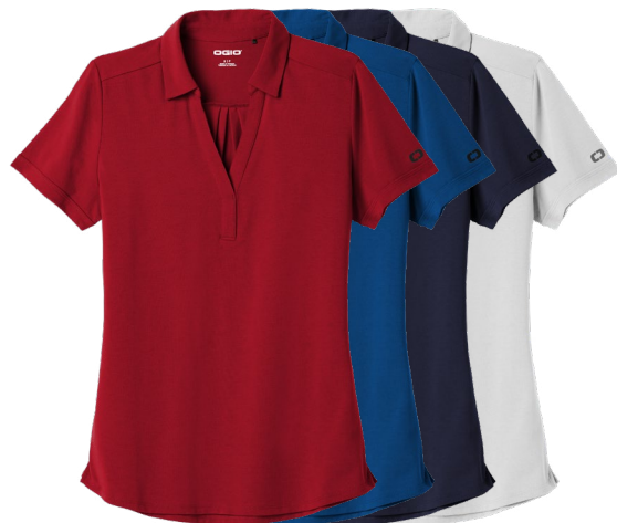
OGIO Ladies Limit Polo LOG138 Women's Sizes: XS-4XL | 7 colors