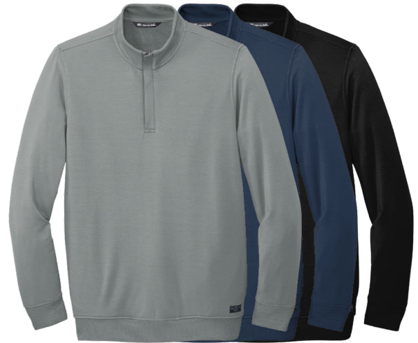
TRAVISMATHEW Newport 1/4-Zip Fleece TM1MU419 Adult Sizes: S-3XL | 3 colors