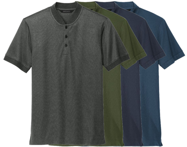
MERCER + METTLE Stretch Pique Henley MM1008 Adult Sizes: XS-4XL | 7 colors