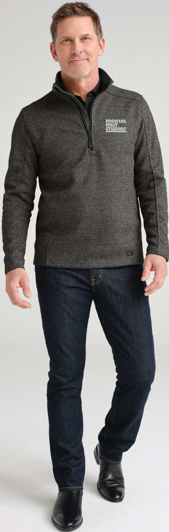
OGIO Grit Fleece 1/2-Zip OG729 Adult Sizes: XS-4XL | 2 colors Worn with TM1MY399