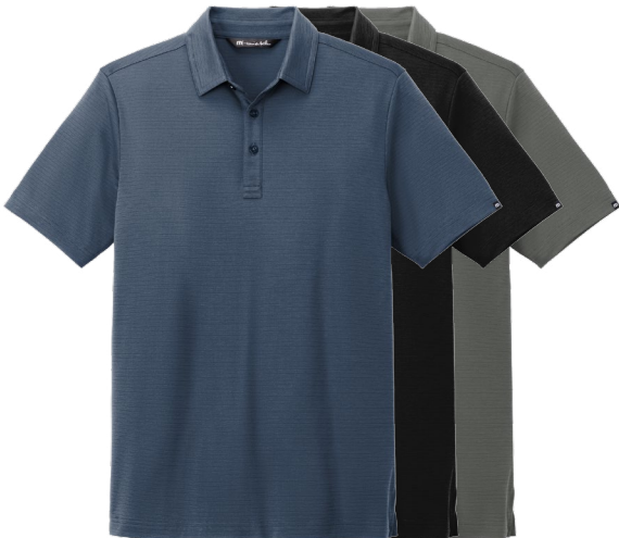
TRAVISMATHEW Bayfront Solid Polo TM1MY399 Adult Sizes: S-3XL | 4 colors