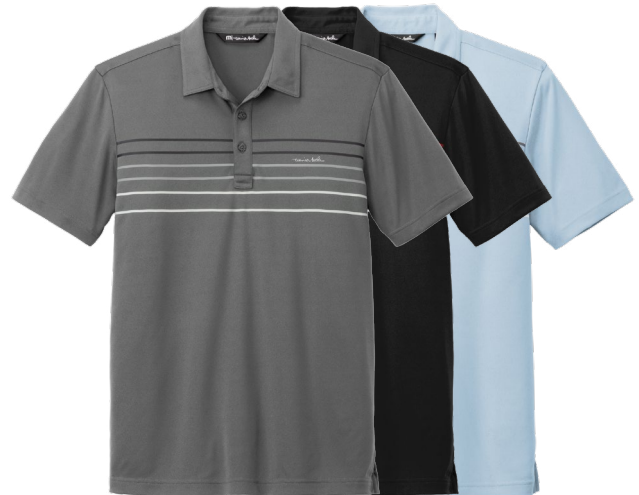
TRAVISMATHEW Coto Performance Chest Stripe Polo TM1MY400 Adult Sizes: S-3XL | 3 colors