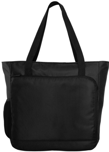
PORT AUTHORITY City Tote BG422 1 color