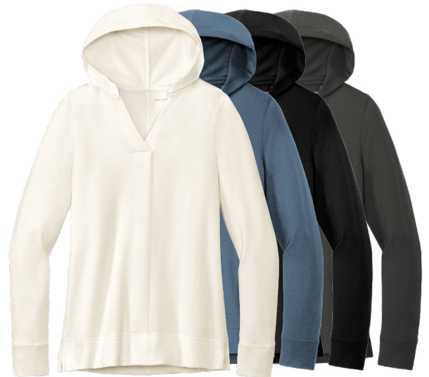
PORT AUTHORITY Ladies Microterry Pullover Hoodie LK826 Women's Sizes: XS-4XL | 4 colors