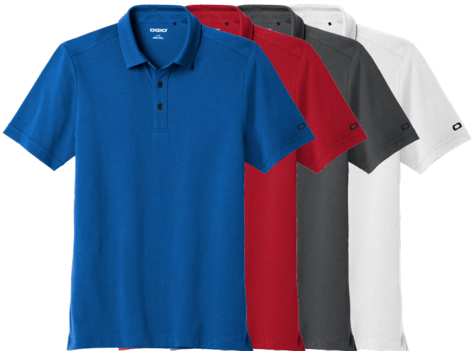
OGIO Limit Polo OG138 Adult Sizes: XS-4XL | 6 colors