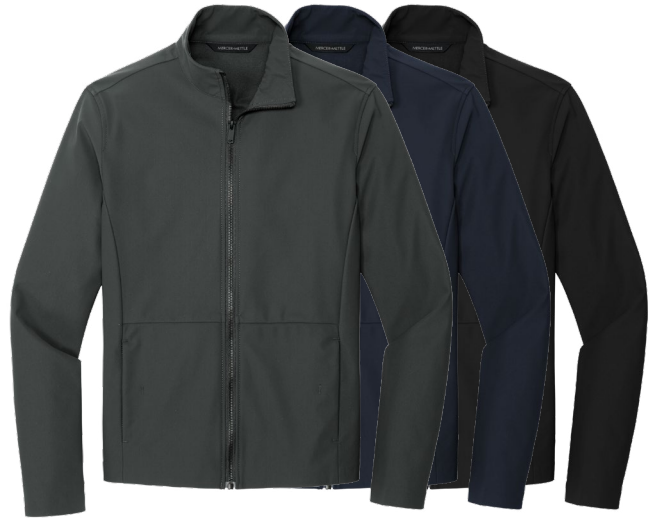
MERCER + METTLE Faillie Soft Shell MM7100 Adult Sizes: XS-4XL | 3 colors