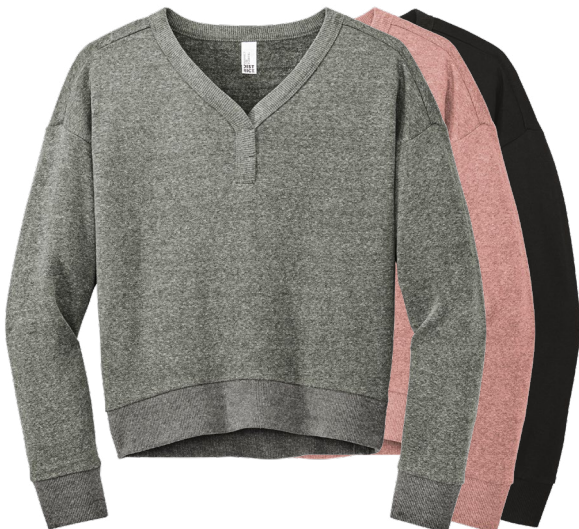
DISTRICT Ladies Perfect Tri Fleece V-Neck Sweatshirt DT1312 Women's Sizes: XS-4XL | 5 colors