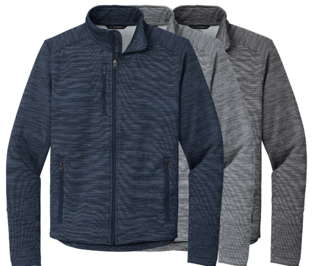
PORT AUTHORITY Digi Stripe Fleece Jacket F231 Adult Sizes: XS-4XL | 3 colors