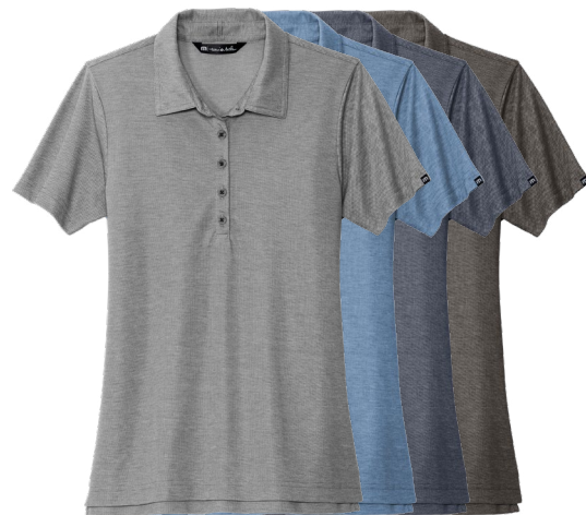
TRAVISMATHEW Ladies Oceanside Heather Polo TM1WW002 Women's Sizes: S-2XL | 6 colors