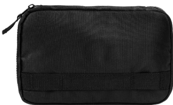
MERCER + METTLE Utility Case MMB700 1 color