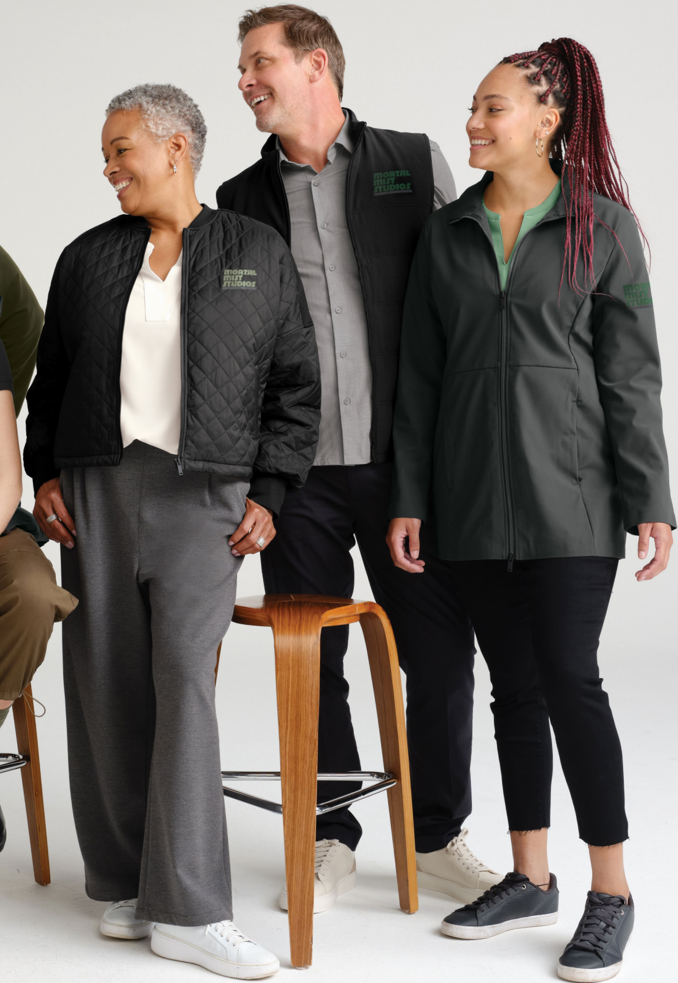
LEFT TO RIGHT: MM1006 MM3000 OG826 MM1001 MM7217 MM7201 MM2011 MM2000 TMIMW453 MM7101 MM2011