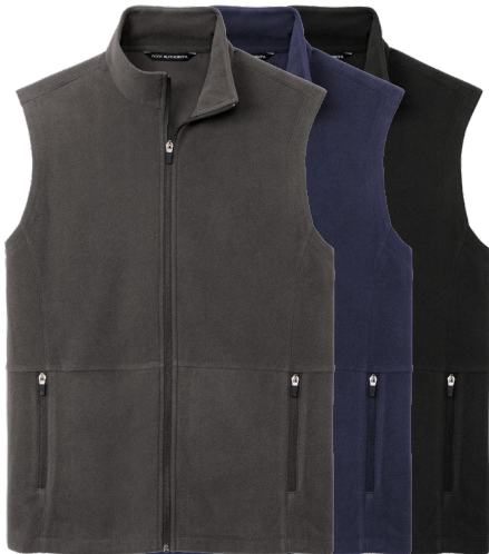
PORT AUTHORITY Accord Microfleece Vest F152 Adult Sizes: XS-4XL | 3 colors