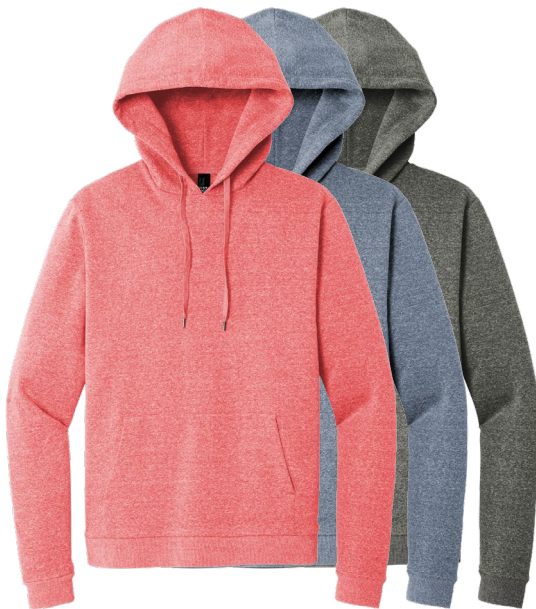
DISTRICT Perfect Tri Fleece Pullover Hoodie DT1300 Adult Sizes: XS-4XL | 12 colors