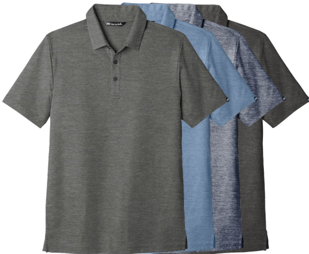
TRAVISMATHEW Oceanside Heather Polo TM1MU412 Adult Sizes: S-3XL | 8 colors