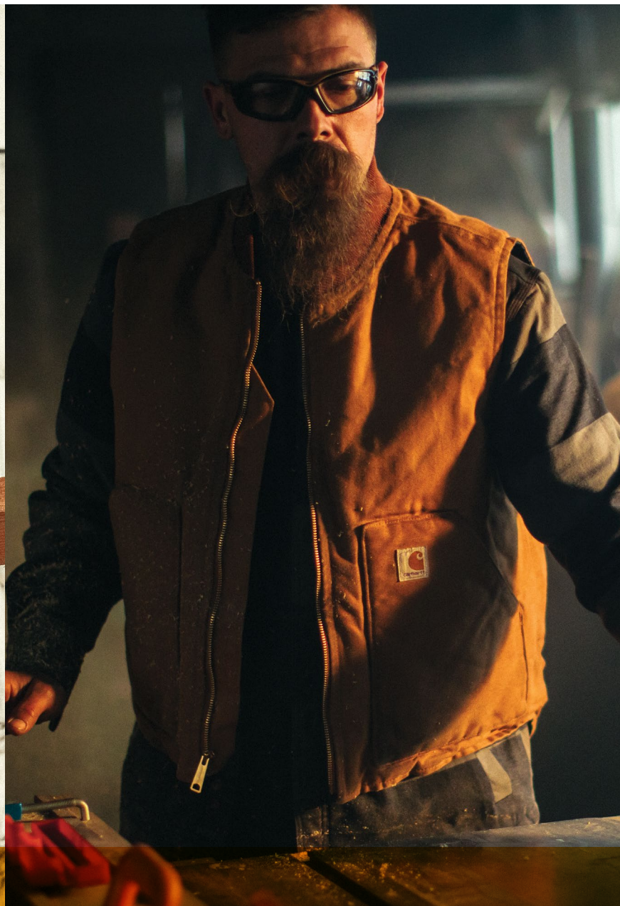
Duck Traditional Coats CTC003 | CTTC003 (Tall)