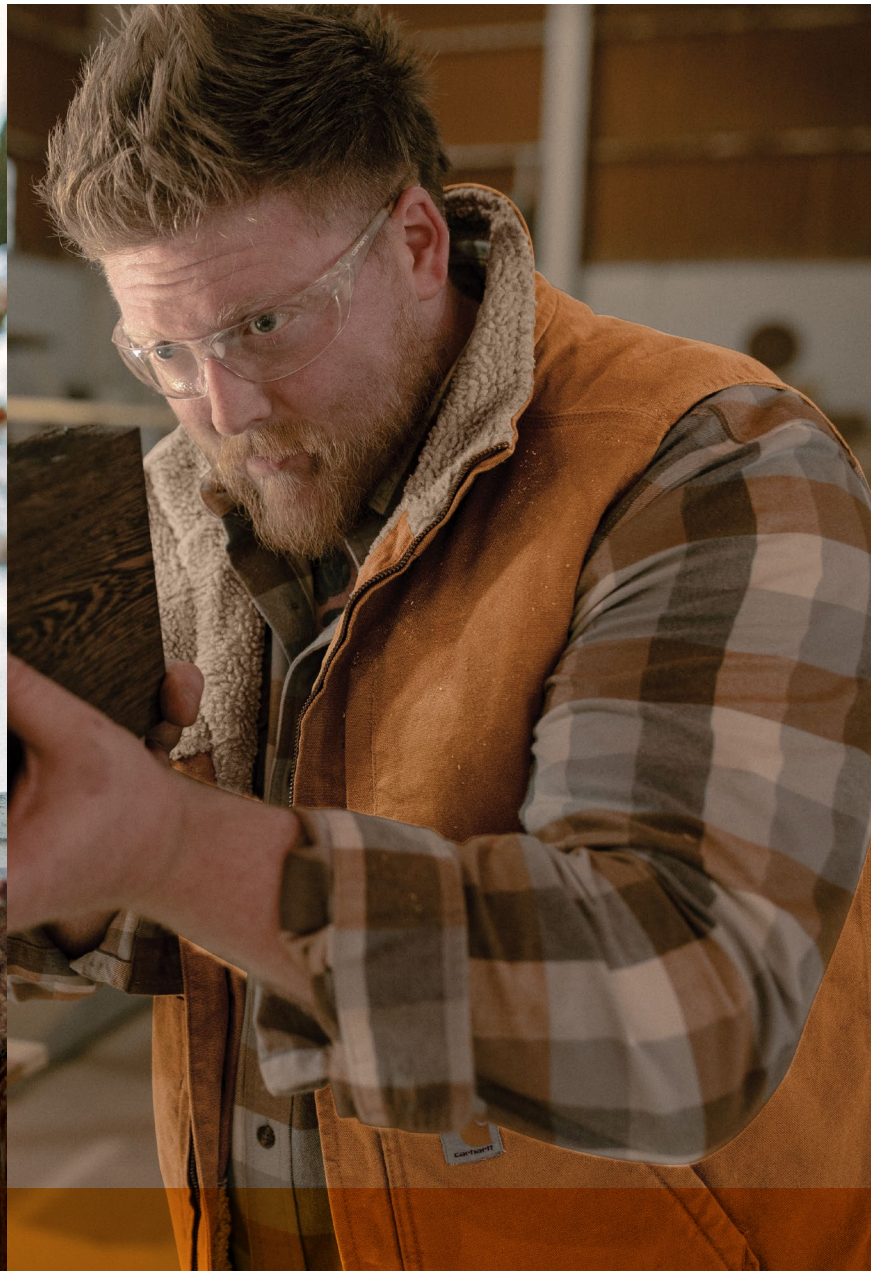
Sherpa-Lined Mock Neck Vest CT104277