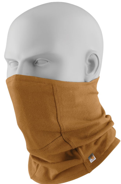
Cotton Blend Filter Pocket Gaiter CT105086