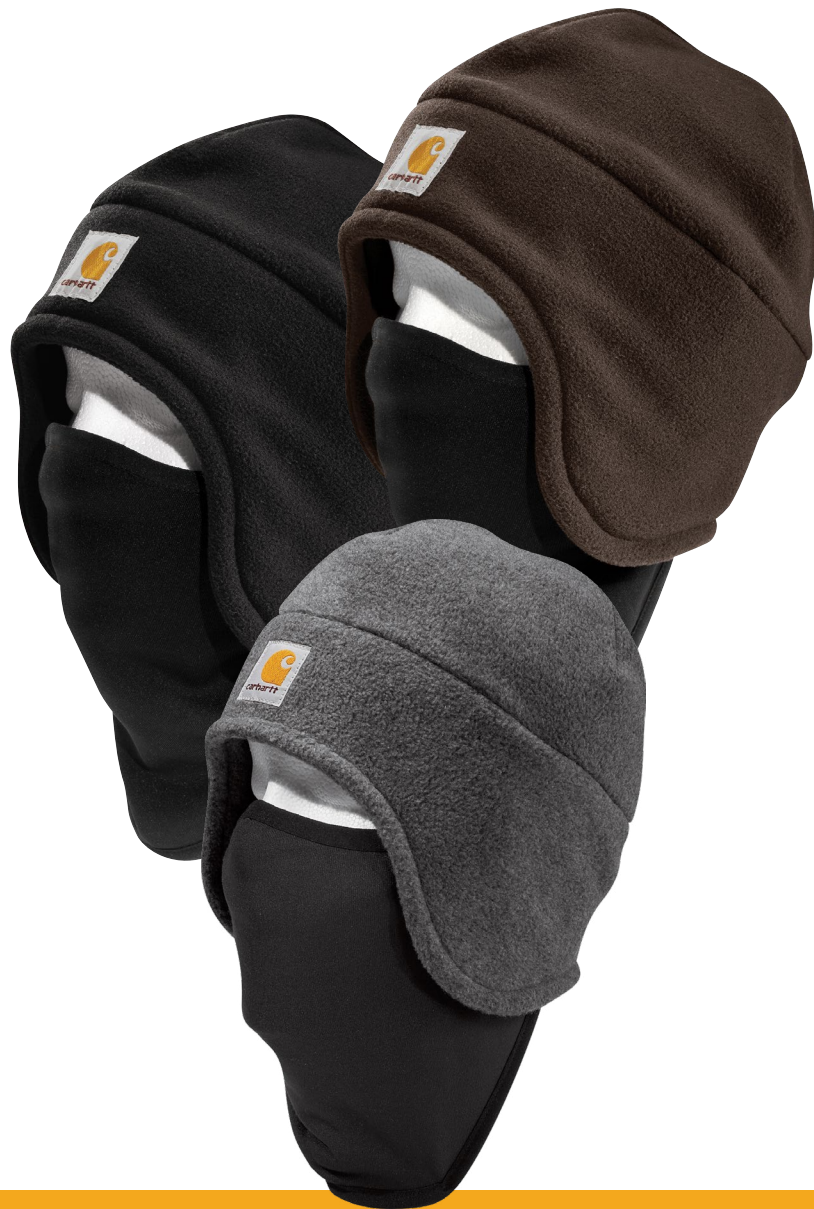
Fleece Hat CTA207