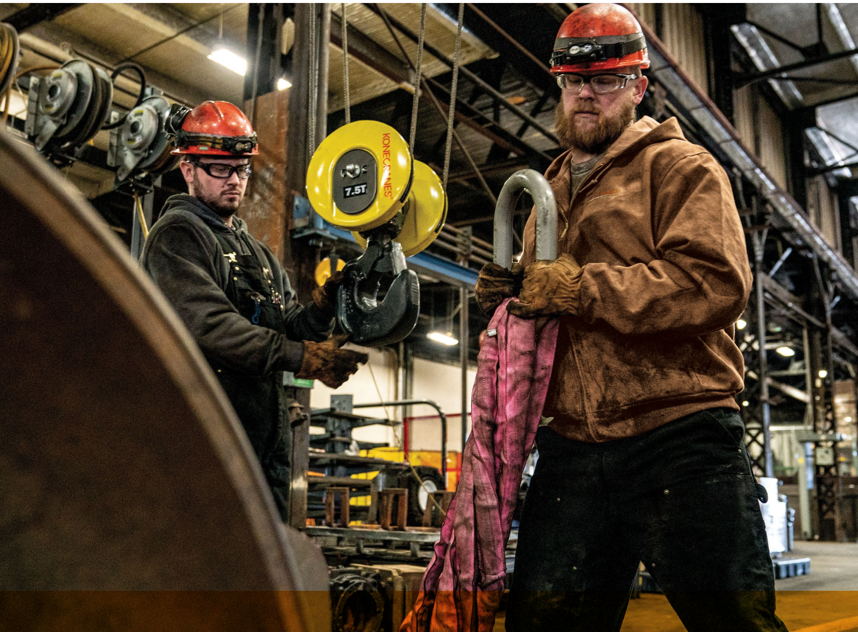
Thermal-Lined Duck Active Jacs CTJ131 | CTTJ131 (Tall)