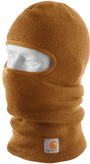
Knit Insulated Face Mask CT104485