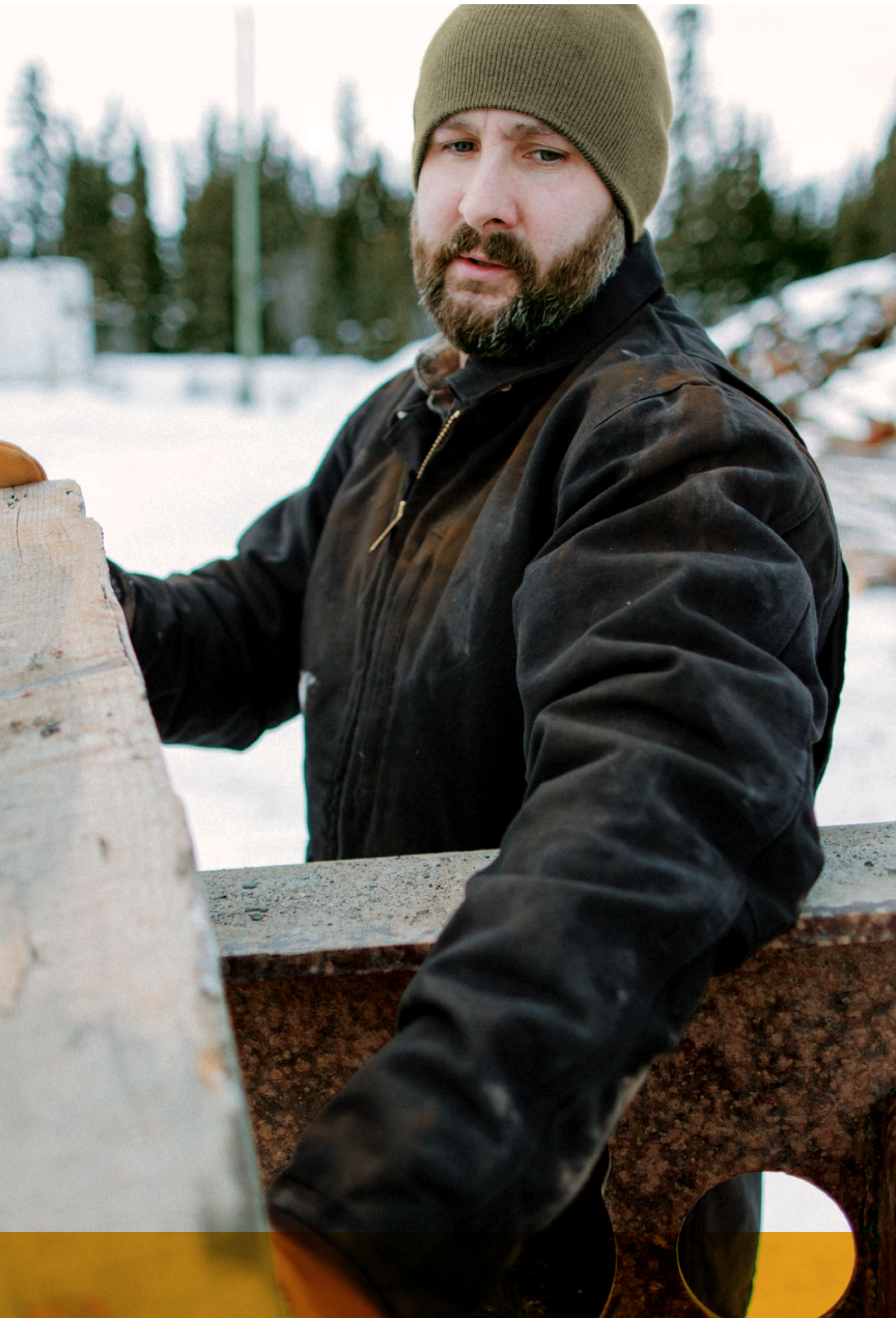
Sherpa-Lined Coats CT104293 | CTT104293 (Tall)