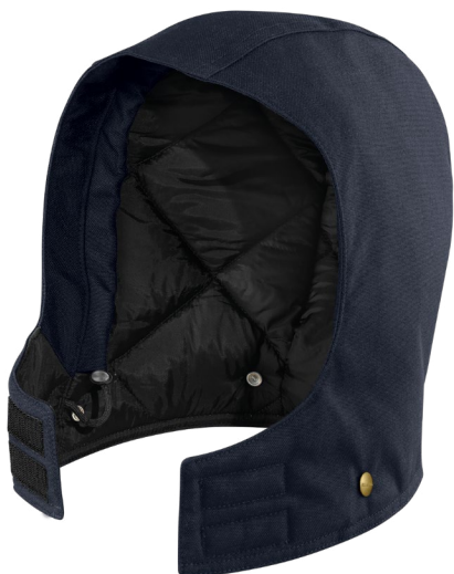
Firm Duck Hood CT102368