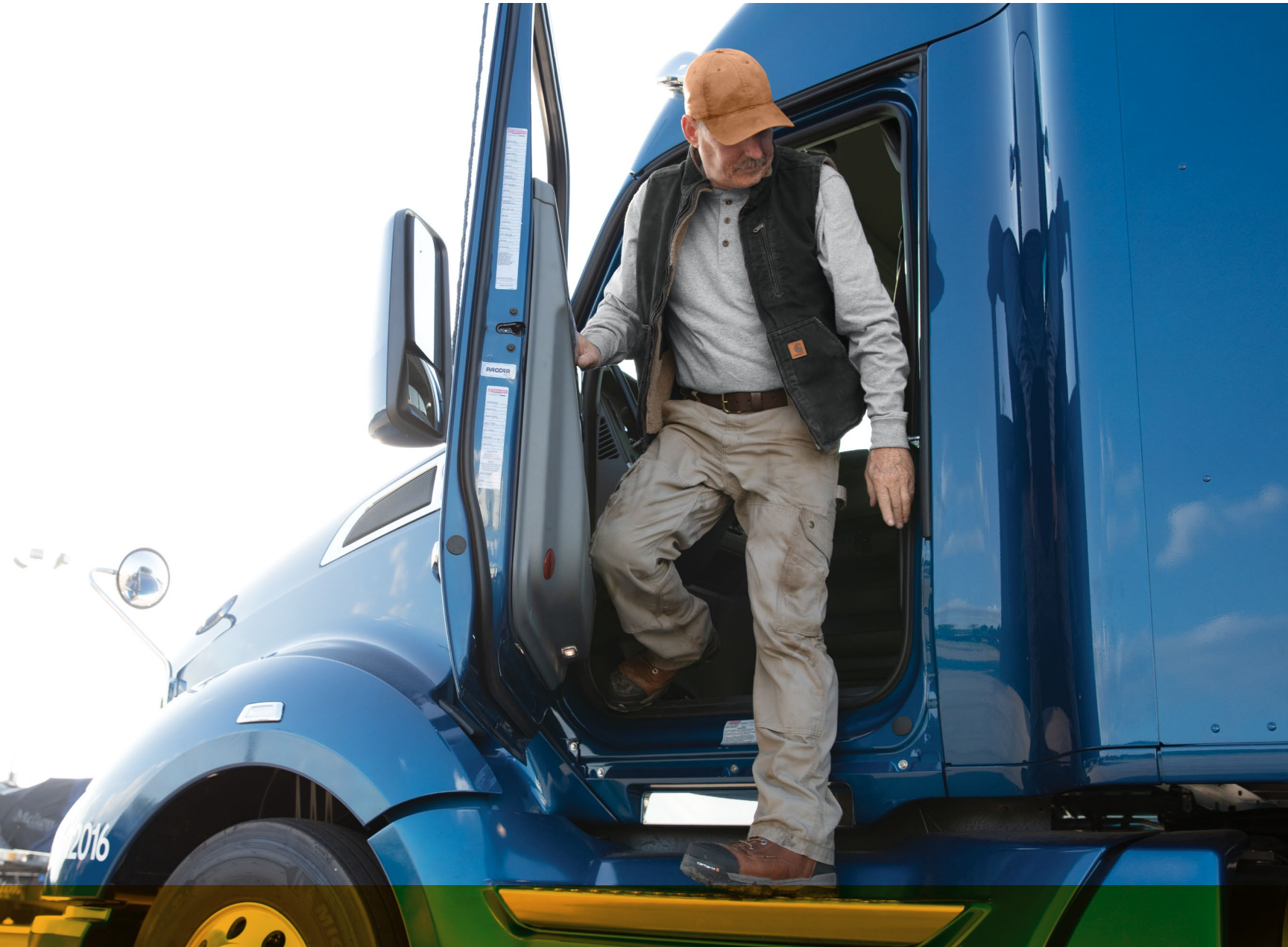
Long Sleeve Henley T-Shirt CTK128