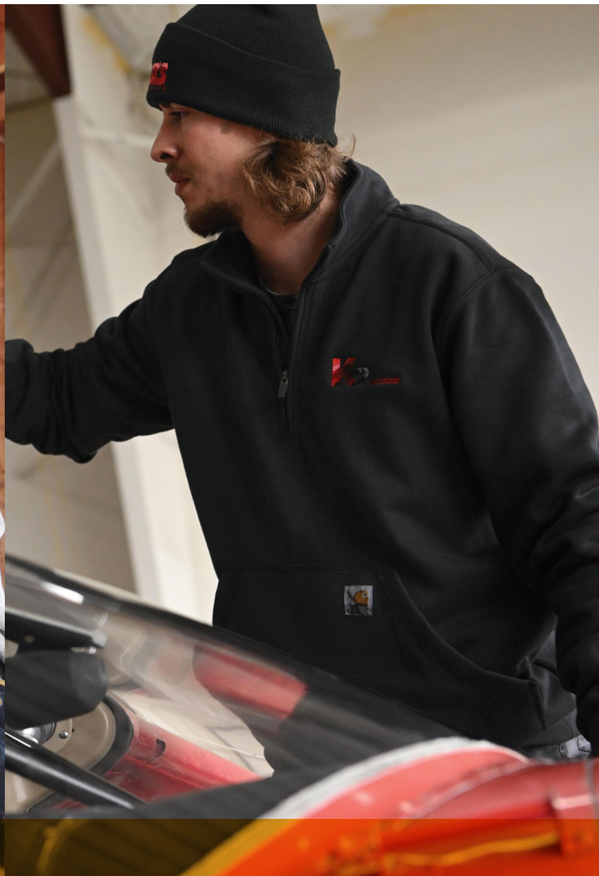
Midweight 1/4-Zip Mock Neck Sweatshirt CT105294